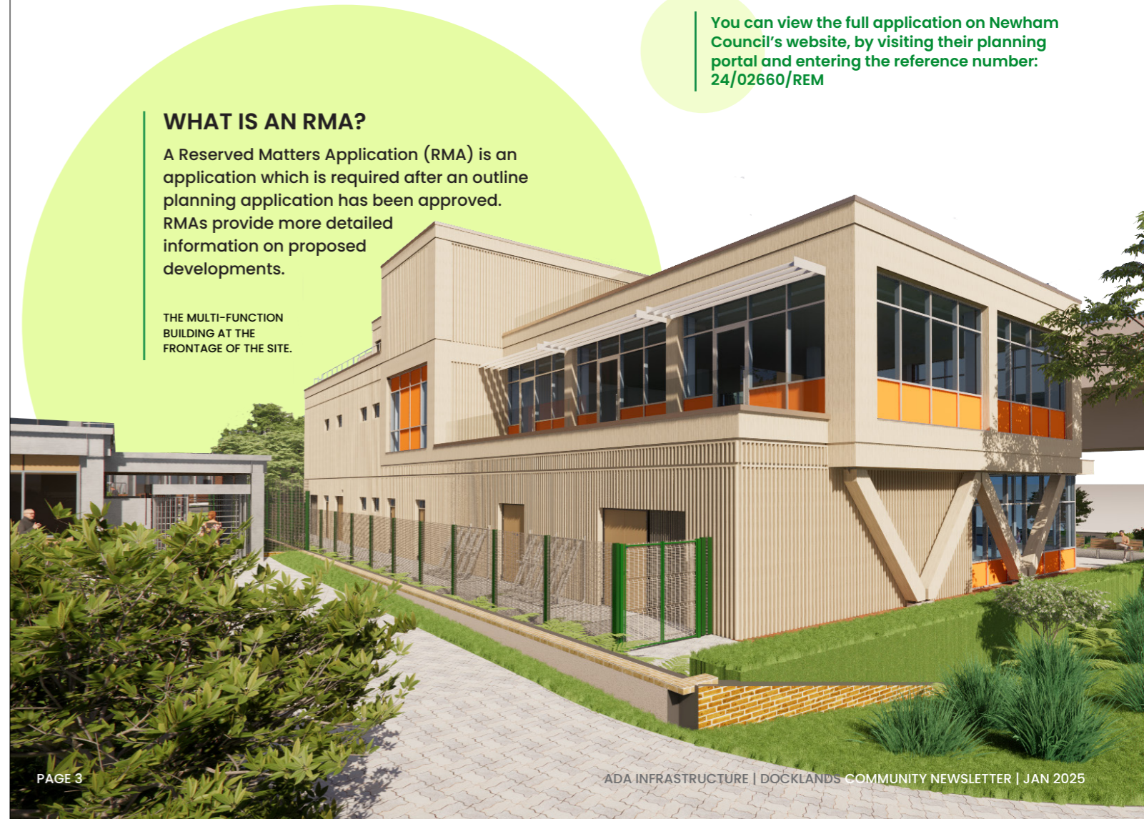
THE MULTI-FUNCTION BUILDING AT THE FRONTAGE OF THE SITE.

You can view the full application on Newham Council's website, by visiting their planning portal and entering the reference number: 24/02660/REM