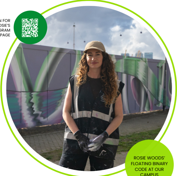
ROSIE WOODS' FLOATING BINARY CODE AT OUR CAMPUS